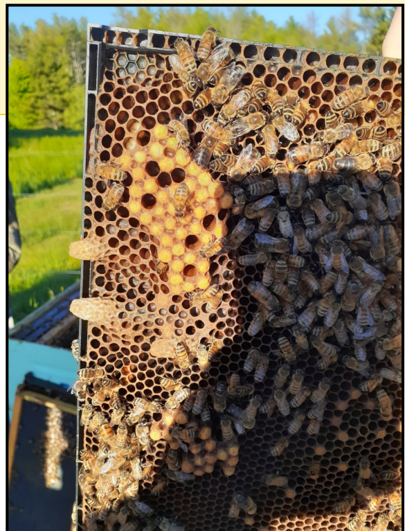
Queen cells in KBA 2.