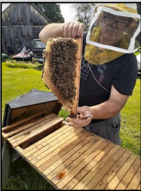
Checking out the topbar hive... looking good!

There have been some great HOWs so far this season, and more to come! Hope to see you at the Apiary!