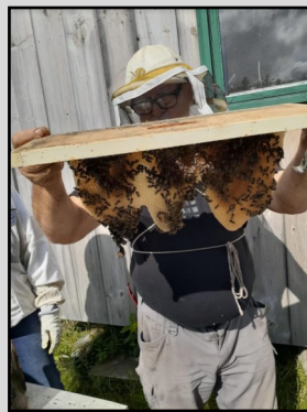
A little too much space in this hive!