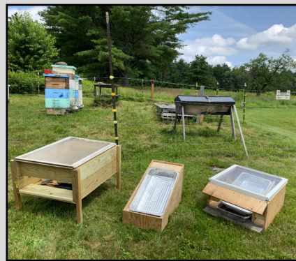
Solar wax melters.