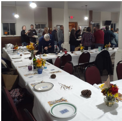
Beautiful table settings.