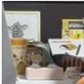
The raffle was a success.