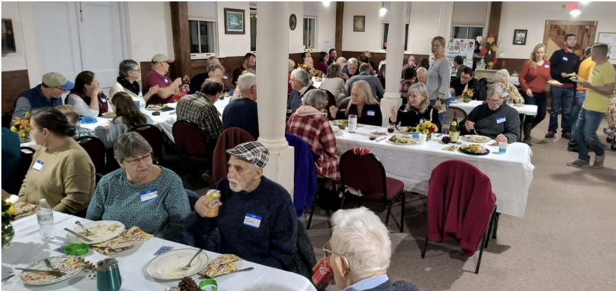
KBA members enjoying the harvest dinner. A packed house!

Thank you to all those who helped make it happen, contributed to the feast, and came to celebrate and have fun!